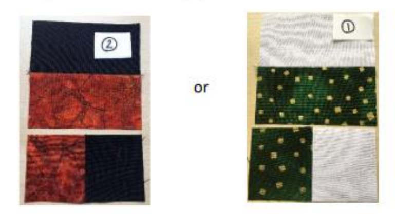
Steps 4 – 7 are the tricky ones – if in doubt as to the orientation, check with the main pictures

3. For each of the colours, sew the 4½ x 2½" rectangle from step 1 to the 4½" square from step 2, taking care to orient each piece correctly. Check with the picture below before sewing. Press. The resulting piece should measure 6½" x 4½"