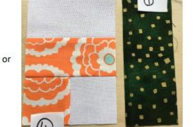
You should now have 4 squares